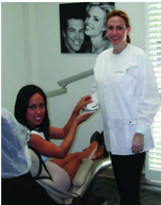
After your treatment you will be offered a warm, scented, moist towel to freshen up.

When the treatment is completed, we will wake you up gently and you will be offered a warm, scented, moist towel to freshen up! Our goal is that you leave smiling with a great feeling that we are taking care of your smile and we are taking care of you!